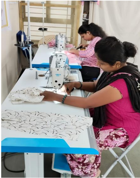
Sewing Machine Operator

In the classrooms, a mix of theory lectures and hands-on practical training unfolds. Students are deeply engaged, whether they're learning the intricacies of healthcare, wiring circuits in electrical training, or honing their skills as Sewing Machine Operators. This hybrid approach, blending virtual remote sessions with in-person practice, as depicted in the images below, showing students absorbed in their classes and collaborating on practical tasks. Additionally, various engaging activities are incorporated to help students better understand the content.